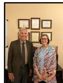
Village Counseling & Consulting 200 W. Magee Rd., #100