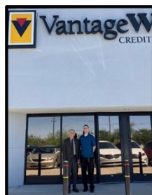
Vantage West Credit Union 550 W. Magee Road