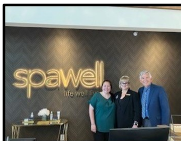
SpaWell at El Conquistador 10000 N. Oracle Road